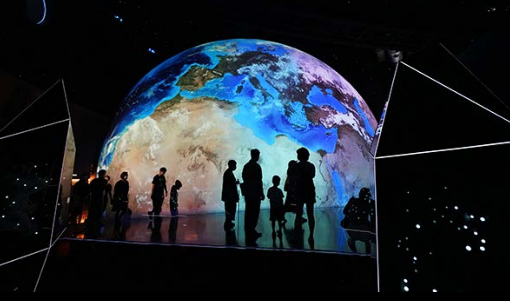
Shanghai Astronomy Museum